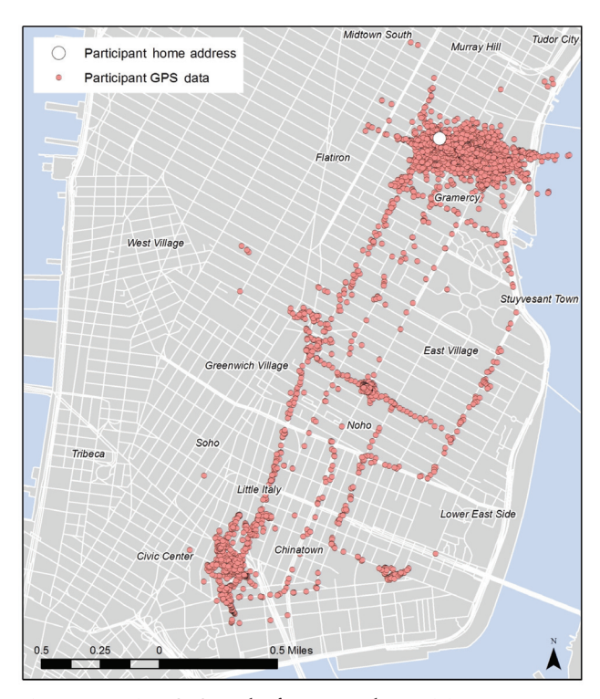
Fig. 3. Mapping GPS tracks from a study participant.

left a total sample size of 1,358,610. The total number of GPS points per participant for the duration of the study varied from a low of 45 to a high of 148,690, with a median count of 8,672 and mean count of 11,920 per participant. Of the total of 114 participants with any GPS data, 112 (98.2%) had at least one hour of GPS data for one day as indicated by 120 GPS fixes on a day given our 30-sec sampling rate and 84 (73.7%) had at least one hour (120 GPS points) on 7 or more days (Fig. 2). When participant data (n = 112)were disaggregated by the number of days participants wore their GPS, we found that the participants had between 1 and 11 days with at least 120 GPS fixes (mean: 7.44, SD = 2.15). Using a cut-off of 5 hours of wear-time as a threshold, indicated by 600 GPS data points per day, 109 of 114 participants or 95.6% had at least 5 hours of wear-time on 1 or more days. However, only 49 or 42.9% had 5 or more hours of wear-time on 7 days of the study. A map of the raw GPS data from one study participant is shown in Fig. 3.