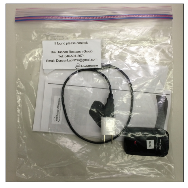
Fig. 1. Picture of a GPS kit, used in the NYC Low-Income Housing, Neighborhoods and Health Study.

monitor with you today?" meant to help the participant remember to charge the unit and carry it with him or her throughout the week. Prior to distribution, we set the GPS device to log in at 30-sec intervals (so if a participant wore the GPS device for an hour it would have 120 counts). The GPS device (carrying a unique GPS serial number and with the battery fully charged) was given to participants in a large zip-lock bag, which also contained a mini USB charging cord, a USB wall adapter, a manufacturer-provided GPS belt holder (if requested), a pamphlet containing background information on GPS and the travel diary (see Fig. 1 for a picture of a GPS kit). Upon completion of the week-long GPS protocol (i.e. carrying the device for all journeys, charging the device daily and completing the travel diary), researchers went to community locations (i.e. a coffee shop and a library) in the participant's neighbourhood to obtain the GPS devices or