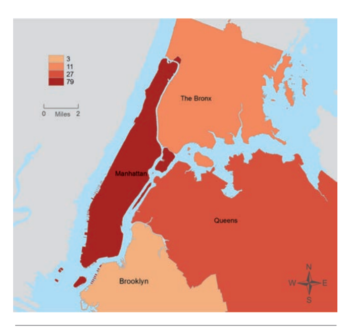
Figure 1. Number of participants by borough, New York City Low-income Housing, Neighborhoods, and Health Study.