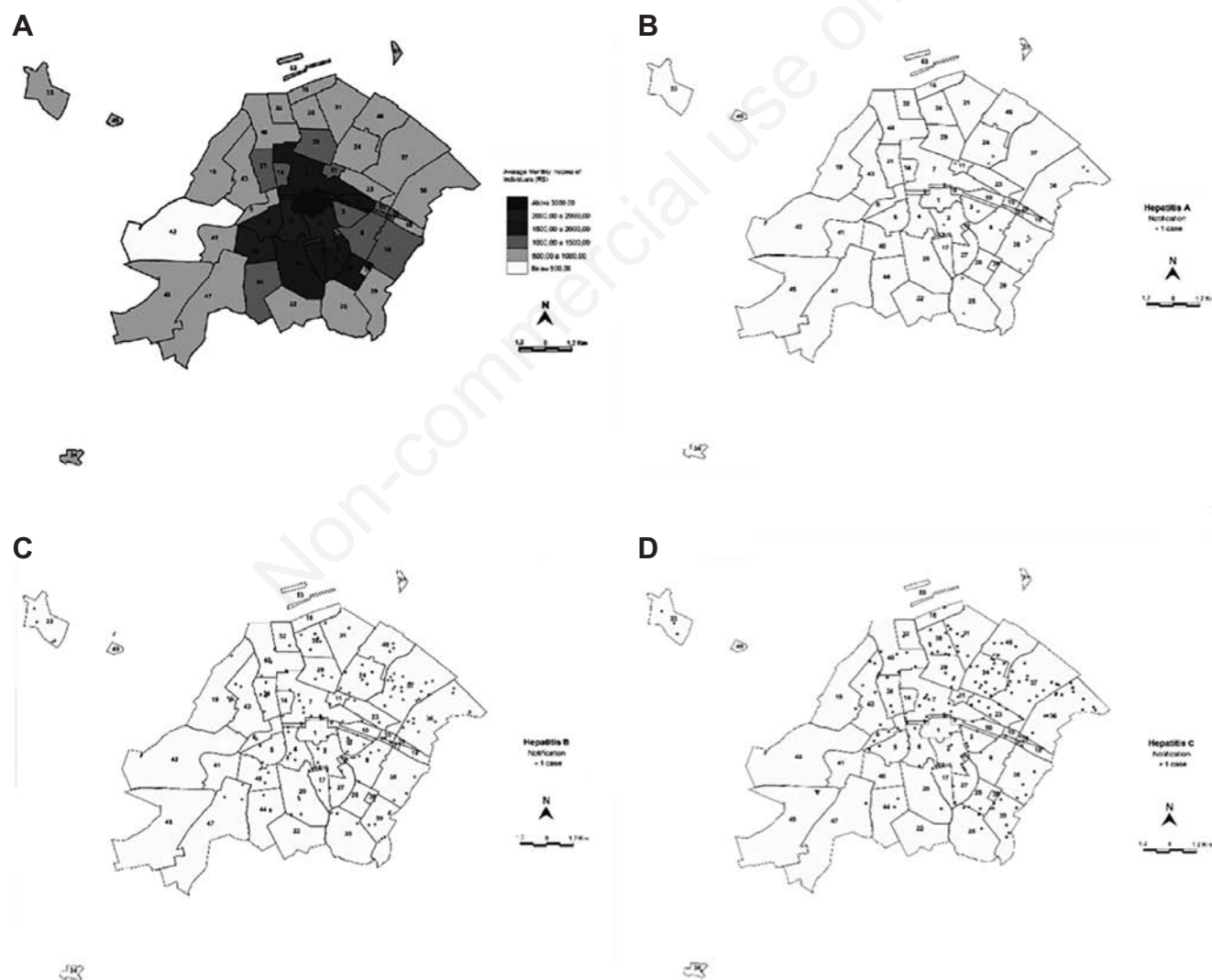
Figure 2. Spatial distribution of reported cases of viral hepatitis in the municipality of Maringá, Paraná, Brazil 2007-2010. A) Spatial distribution in areas with similar income levels; B) Spatial distribution of confirmed cases of viral hepatitis A; C) Spatial distribution of confirmed cases of viral hepatitis B; D) Spatial distribution of confirmed cases of viral hepatitis C.

Several cases appeared in census zones 24, 36 and 37 (5.7%), however, these zones have relatively large populations, 27,137, 32,687 and 22,078 inhabitants, respectively. Census zones 10, 13, 22, 41, 42, 45, 49, 50, 51 and 53 (21.1%) had no reported cases. In 2008, four cases of hepatitis A were reported in zone 38. In 2009, there were no cases of hepatitis A in this zone. In addition, from 2007 to 2010, 11 cases (7 cases of hepatitis B and 4 cases of hepatitis C) were reported in the rural and urban districts (Figure 2B-D). Regarding the distribution of hepatitis C in the municipality,