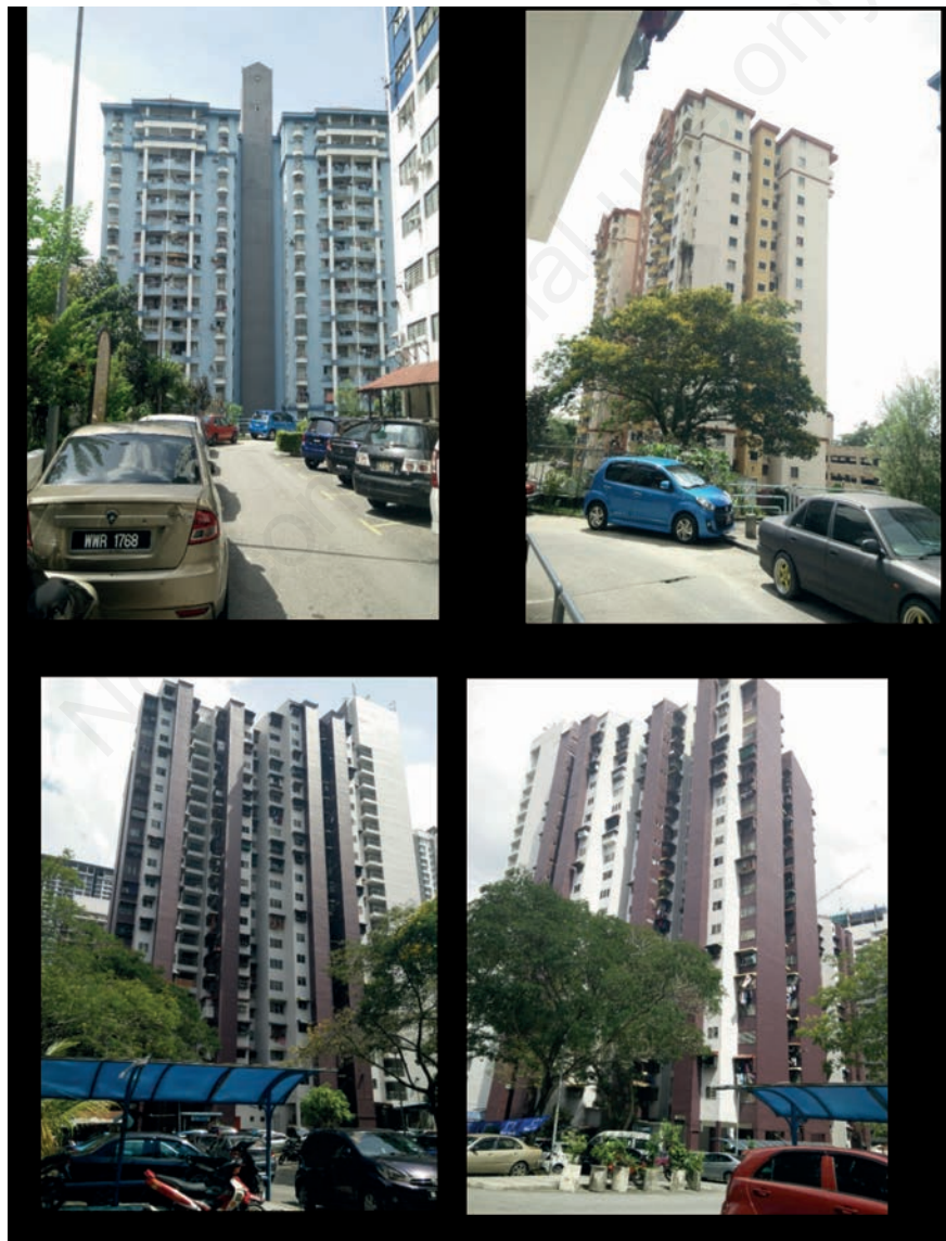
Figure 4. Two high-rise residential apartment buildings in the study areas that had high numbers of dengue outbreaks. Top: Apartment Building 1; Bottom: Apartment Building 2 (for location see Figure 3).

Dengue has a complex epidemiology as it includes many dynamic transmission interactions between virus, vector and the human host. These factors influence the transmission directly and indirectly, and our study cannot account for all possible variables. Additional data are needed, such as knowledge of virus serotype and genotype, host immune status, vector density, urban water sup-