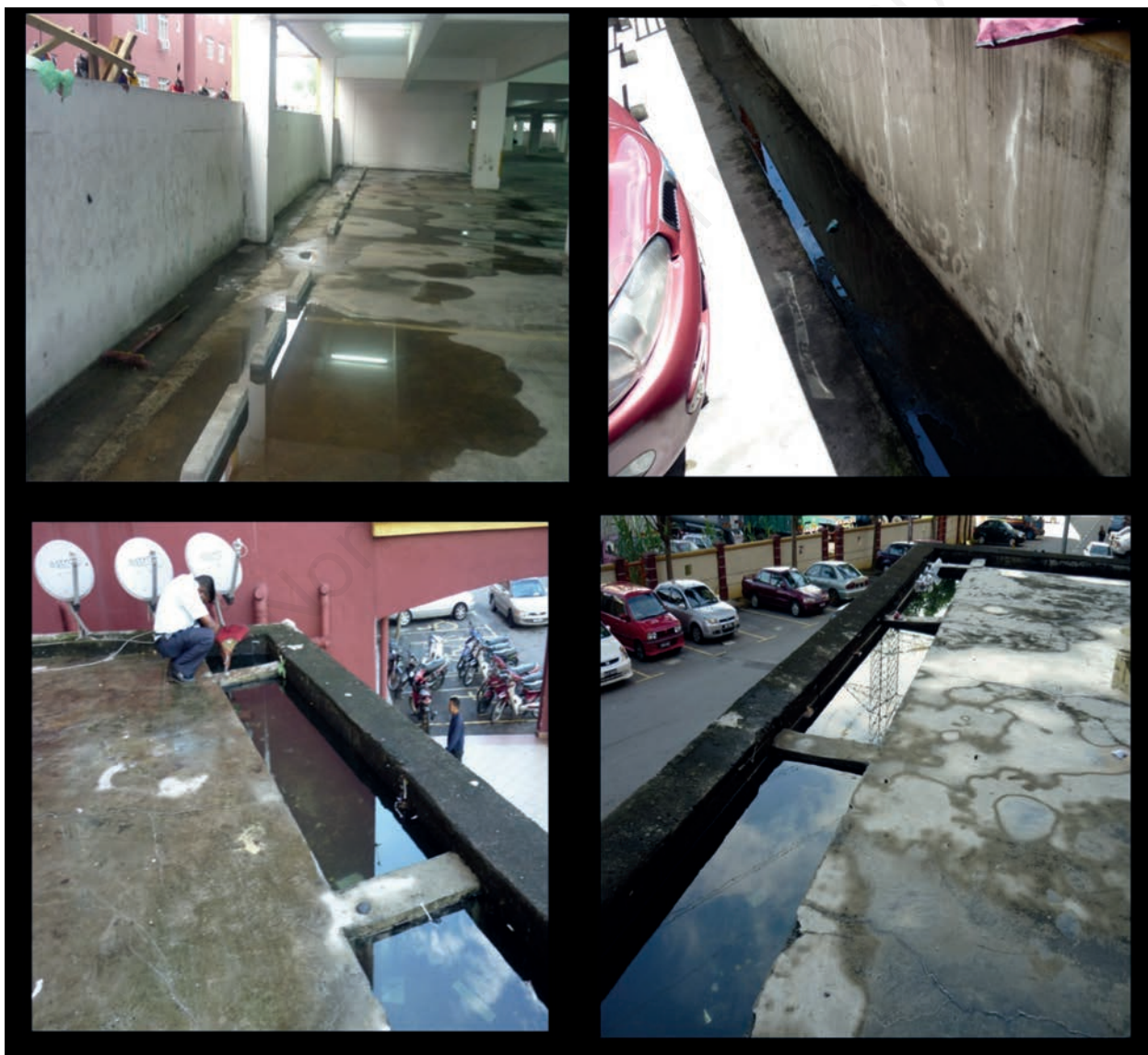
Figure 5. Stagnant water in the high-rise apartment buildings, which provides ideal habitats for Aedes mosquito breeding. Top: Apartment Building 1; Bottom: Apartment Building 2 (for location see Figure 3).

We conclude that dengue remains a major threat to socio-economic activities and certain geographical conditions promote mosquito reproduction and disease transmission. The geospatial application through quadrant analysis described here identified residential areas with high population densities as the places with the highest number of dengue outbreaks, and that the temperature variable plays a major role for dengue transmission. Since neither drugs nor vaccines are currently available, vector control is the only way to break the transmission cycle. Findings from this study should contribute to the planning of more effective vector control interventions as geospatial applications can support public health departments and agencies in planning control and surveillance.