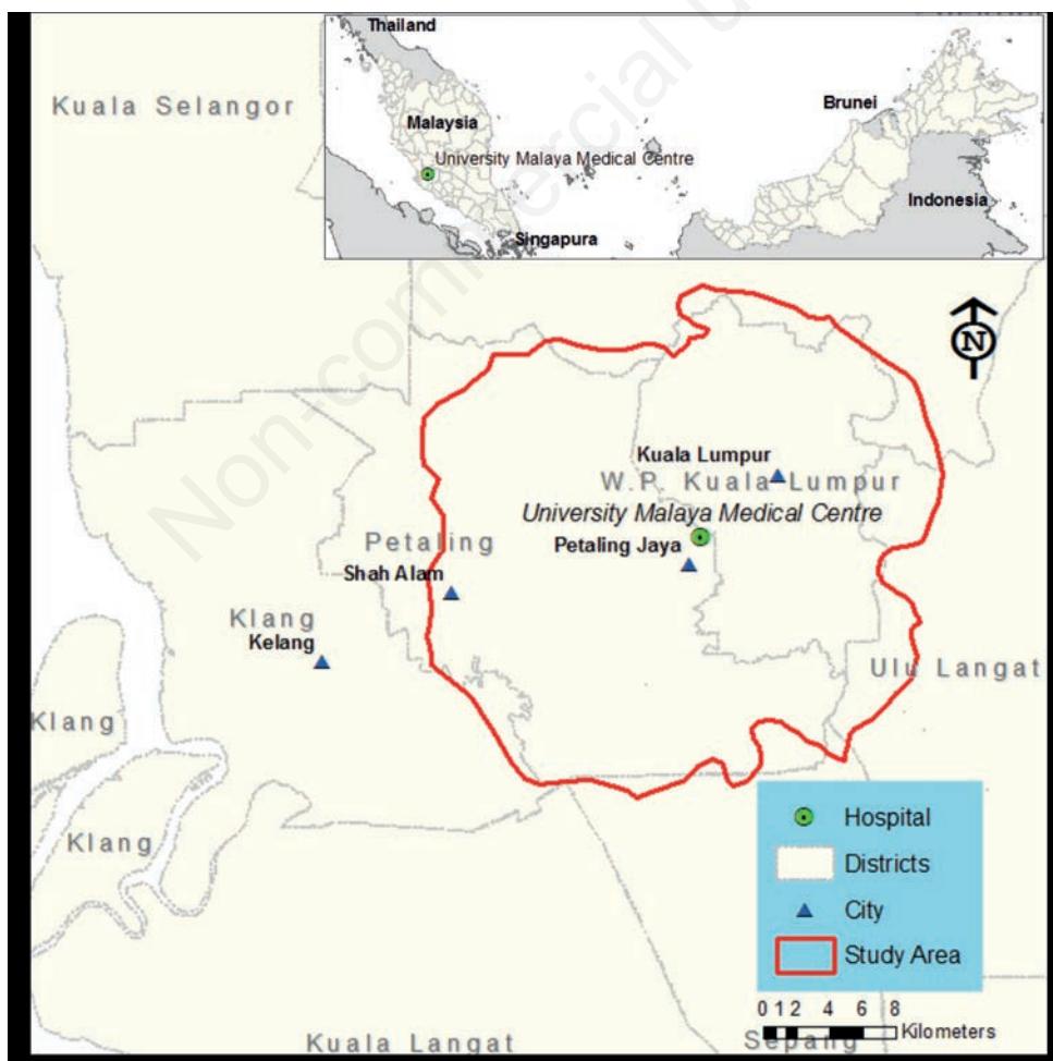
Figure 1. Study area location.

The Petaling District, which includes Petaling Jaya, Shah Alam, and Subang Jaya have recorded the highest number of dengue cases in Selangor (JKN Selangor, 2016). From the University Malaya Medical Centre (UMMC), we obtained the confirmed dengue case data for its catchment area (101°39'11.50"E, 3°6'48.59"N) (Figure 1). This hospital was chosen for this study because it is situated in the Petaling District and Kuala Lumpur, with a consistently high number of dengue cases. Furthermore, UMMC maintains an annual record of dengue cases required in