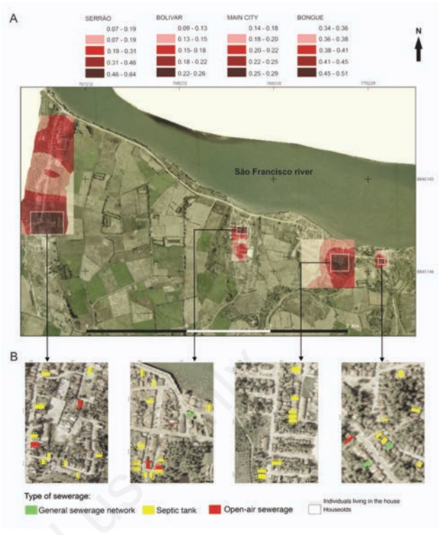
Figure 2. (A) Risk areas for S. mansoni infection in the urban villages of Ilha das Flores, expressed as a probability of occurrence with values ranging from 0 to 1. (B) Each of the squares below shows a detail of the hot spot areas of the villages of Serrão, Bolivar, Main City, and Bongue, respectively. Types of sewage system from the houses marked in the map: houses with general sewerage network are painted in green; with septic tank in yellow and open air sewerage in red. The round dots around the houses are the individuals living in the houses.

The spatial analysis is presented as descriptive maps showing raw prevalence estimates of S. mansoni infection with the kernel estimator. The highest risk areas were in the southern part of Serrão village, in the south-eastern part of Bolivar village, in the poorest area of the city center and along the river bank in Bongue village. The majority of the individuals (393/500, 78.6%) in these villages live in houses with septic tanks installed, while others (25/500, 5%) belong to a general sewage network or have open-air sewerage (55/500, 11%). A minority of the individuals (27/500, 5.4%) did not answer to this question. We observed that the majority of the septic tanks were not adequately built and therefore contaminated the surrounding soil. We also observed that there was a higher number of open-air sewerage/septic tanks than homes connected to a sewage network in the areas with higher risk for S. mansoni (Figure 2). We also observed in the cartographic maps a proximity of the rice field, surface water and the urban area (Figure 3).